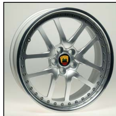
Sportline forged wheel, 3-piece