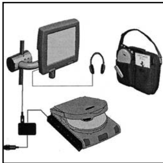
Arden Vision 0040 JRN