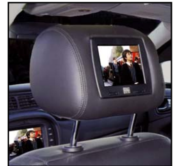
Arden Entertainment System

The Arden Entertainment System offers Multimedia-Feeling at the highest Level. No matter if it's DVD, digital TV or the integration of a gaming console, almost everything is possible, to the point of a complete equipped Business-Mobile.