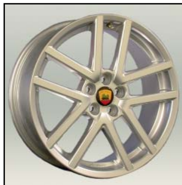
Multi Spoke Wheel Sportline