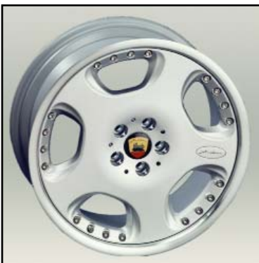
Arden Design III Wheel

Arden light metal wheels will give your X-Type not only a sportive elegant look but they are harmonised especially to your JAGUAR saloon. Arden light metal rims are manufactured in original equipment quality. This guarantees optimum riding properties and excellent running characteristics. For tyres, Arden recommend PIRELLI high-performance tyres.